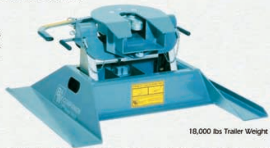
18,000 lbs Trailer Weight

PLACE MOUNTING POST INTO RECEIVER... TIGHTEN DRAW DOWN BOLT & U-BOLTS... INSTALL COUPLER HEAD... & YOU'RE READY TO TOW.